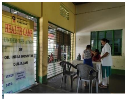
HEALTH CAMP BY OIL