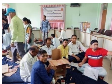
TRAINING AT VARANASI ON PROJECT IDCYD