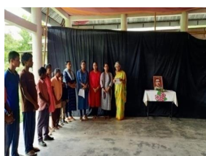
BISHNU RAVA DIVAS