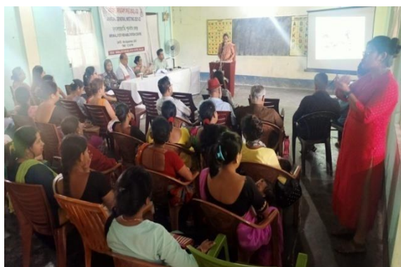
PRESENTING the ANNUAL REPORT 2021-2022