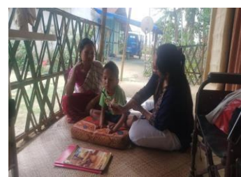
Figure 7: FIELD VISIT