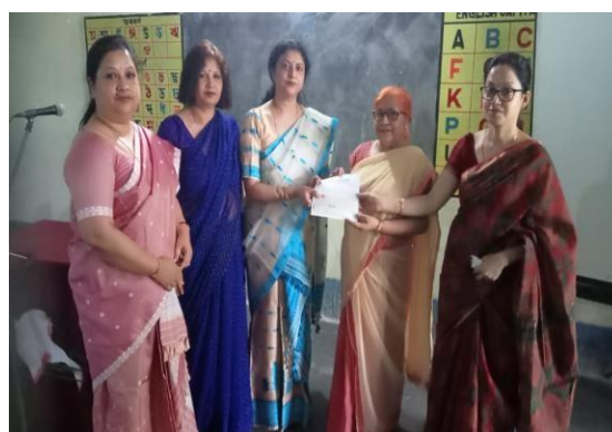
HANDOVER OF CHEQUE BY ZALONI LADIES CLUB TO THE SECRETARY, MRC.