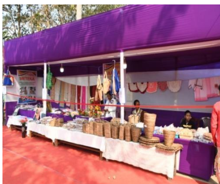
STALL DURING SILVER JUBILEE INAUGURATION