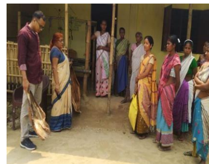
AWARENESS ON DISABILITIES