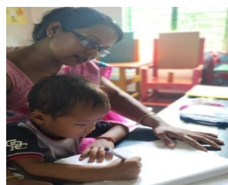
Figure 9: PREPARATORY CLASS