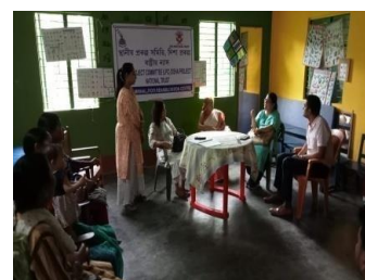
Figure 4: LPC MEET