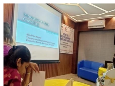
DISTRICT LEVEL CAPACITY BUILDING WORKSHOP