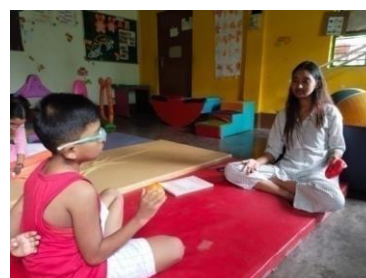
Figure 1: OCCUPATIONAL THERAPY