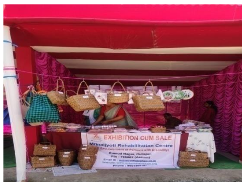
STALL AT AMCH, DIBRUGARH