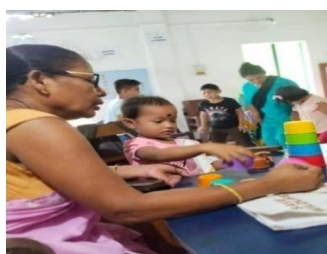
Figure 8: SPECIAL EDUCATION