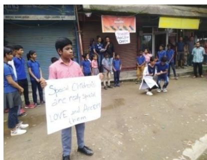
STREET PLAY ON CwDS