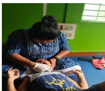
Figure 2: SPEECH THERAPY