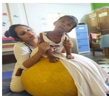
Figure 3: PHYSIOTHERAPY

The most important & fundamental unit of the organization is the Early Intervention Unit. This unit works on Early Identification and Early Intervention and to carry out these services we have Physiotherapist, Speech Therapist, Occupational Therapist, Special Educator, Counselor, guest neuro-development therapist and trained teachers. This unit also aims at School readiness program and mainstreaming. “ DISHA ’ a project of National Trust ( Statutory body of the Ministry of Social Justice and Empowerment Government of India ) is also running in our Early Intervention centre which mainly aims in the development of children from 0 ages to 10years.