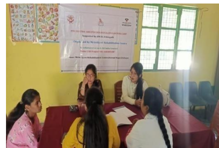
Psychologist & Psychiatrist