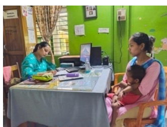
Figure 6: ASSESMENT