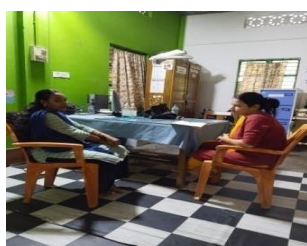
Figure 5: COUNSELING